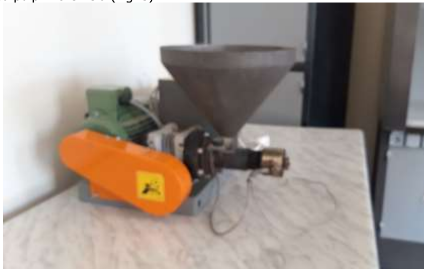
Figure 3. Laboratory device for extracting oil from grape seed by pressing method

In addition to these factors, scales were used to measure the mass of the product, SESH-3M drying devices were used to determine the initial moisture content of the product, etc. A special laboratory device was proposed for processing and pressing grape seed pulp in the field (Fig. 3).