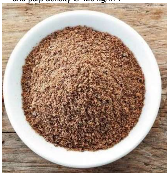
Figure 4. Grape seeds and crushed

CONCLUSION. Processing grains without heat treatments results in a lower fatty acid count. In order to obtain high-quality oil, it is necessary to carry out the