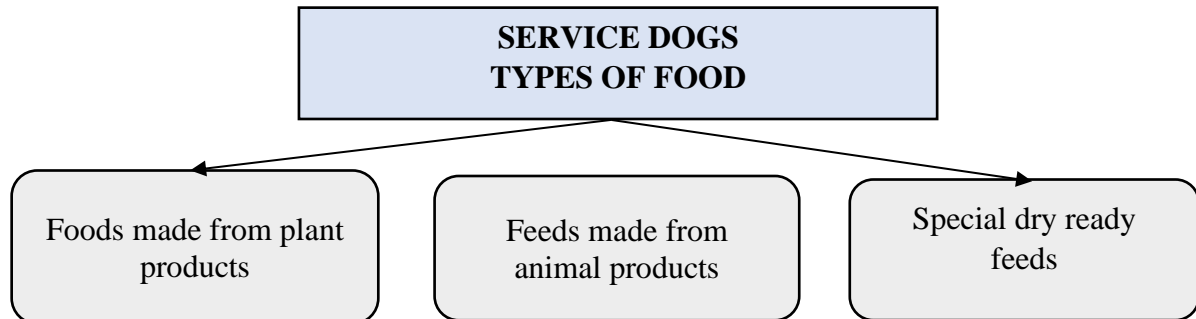
Figure 2. Types of service feed 2

When training service dogs, it is important to feed the service dog correctly and rich in rations, which greatly affects the efficiency of their service activities. When feeding service dogs, it is advisable to analyze the composition of feed made from animal and vegetable