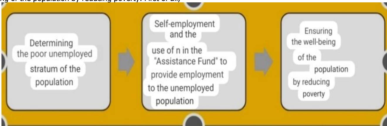
Figure 1. A sequence of measures to ensure the well-being of the population by reducing poverty

the unemployed and poor strata of the population are identified in each neighborhood. The sequence of execution of these activities is presented in the following figure (Figure 1).