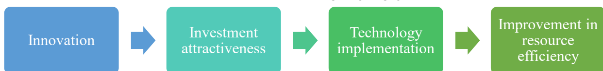
Figure 1. The interrelationship between innovations and the investment environment 1

Thus, the sequence "innovation-investment attractiveness-technology implementation-improvement of resource efficiency" forms a continuous economic cycle that ensures sustainable and efficient development in the energy sector. This approach allows resource efficiency to be conceptualized as an object of strategic management and provides a deeper understanding of the conceptual foundations for improving the investment environment.